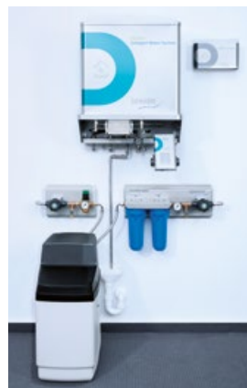
DRAABE DuoPur Compact