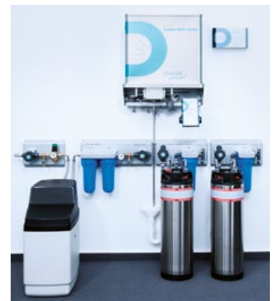
DRAABE TrePur Compact