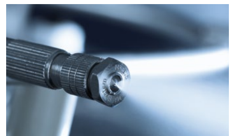
High-pressure nozzle air humidification cools and protects against static electricity

High temperatures and excessively dry air put the service life of servers and storage systems at risk. To cool and protect against static electricity, high-pressure air humidifiers can significantly increase energy efficiency in the data centre. The use of high-pressure air humidifiers offers new energy-efficient options for air conditioning: with pressure of up to 85 bar, high-performance nozzles spray cold water in micro-fine aerosols which are immediately and completely absorbed into the ambient air. The evaporative cooling created in this way reduces the room temperature, while also ensuring optimal humidity.