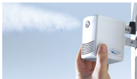
The micro-fine aerosol mist is immediately absorbed into the ambient air