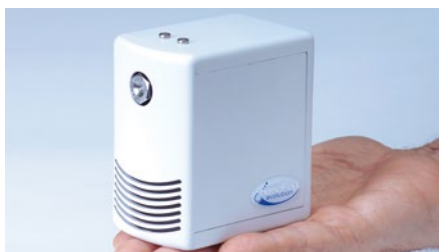
DRAABE NanoFog Evolution suits every server room

* First construction section (server hall 1)